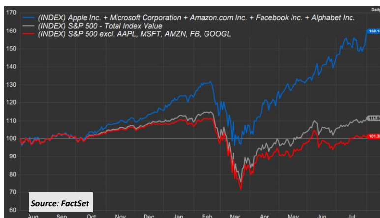
Chart of the Month – Mega Cap Performance vs Rest of the US Market

A year ago, it would have been unthinkable that the US would experience a severe recession and the highest unemployment rate since the Great Depression, while seemingly contrarily delivering significant gains for equity investors. However, over the past year, the S&P 500 Index has gained 11.58% in defiance of the economic backdrop. This rise was driven mostly by Apple, Microsoft, Amazon, Facebook and Alphabet (Google), the five largest companies in the US, which have grown their total market capitalisation by 60.13% over the 12 months. This partly demonstrates how these companies are geared to benefit from the current environment. It also displays that the share market is forward-looking and not necessarily reflective of the economy at a point in time.