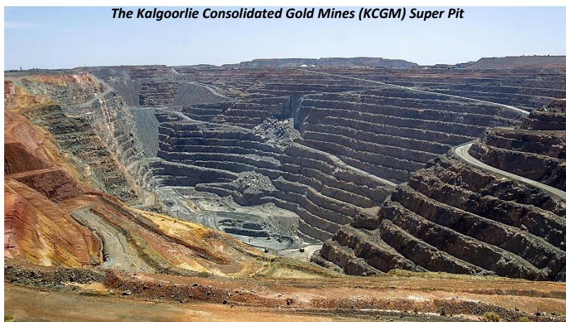
The Kalgoorlie Consolidated Gold Mines (KCGM) Super Pit

The mine has exceeded expectations since inception, with the mine now forecast to produce until 2035, 32 years longer than initially expected. With room for more exploration and the strong capital backing of its consolidated ownership, the site is likely to continue as a rich source of gold production in Australia.