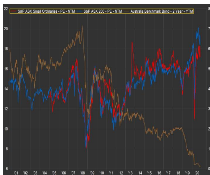
Chart of the Month – Market Pricing & Interest Rates

Source: FactSet financial data and analytics