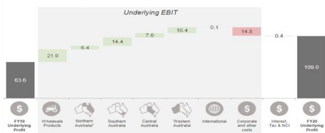
Underlying profit by geography by year ($m)